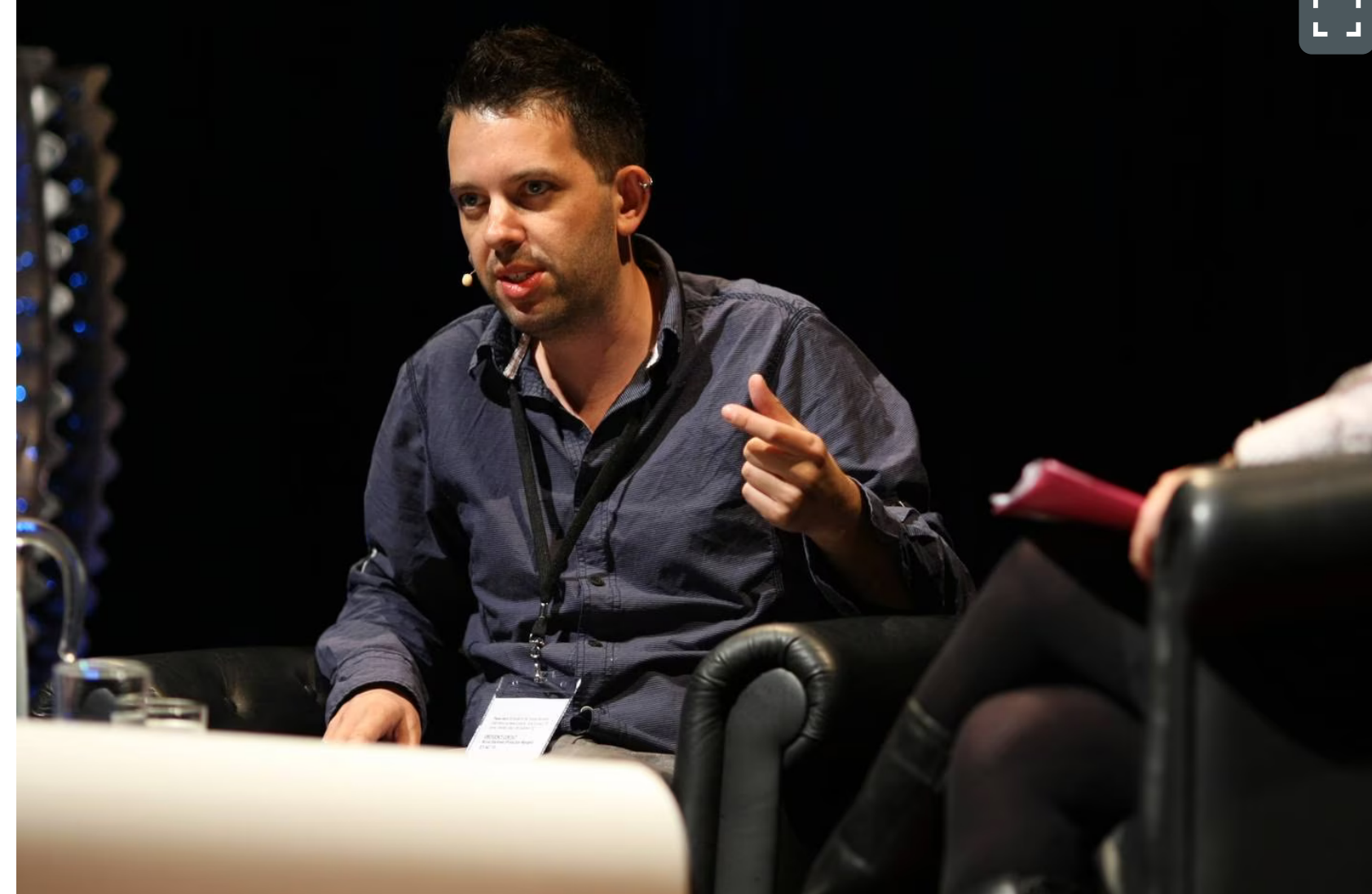
Australian author Antony Loewenstein talks about his book My Israel Question during the Auckland Writers and Readers Festival.

"That's a bit of a PR problem and a moral problem."