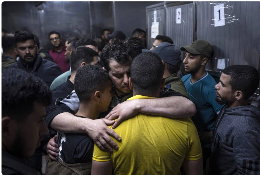
Mourners comfort each other in the morgue of Al-Shifa Hospital after Israeli airstrikes killed a dozen Palestinians.

Now just to let you know, there are many - many - Palestinians who do not support murderous rampages by Hamas. They would no more support the wholesale slaughter of civilians than you would. And anyone who thinks otherwise assigns sentiments to brown people based on idiotic and harmful stereotypes.